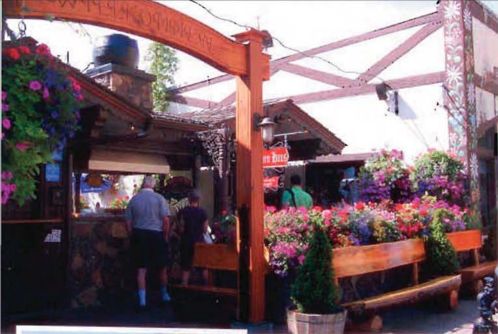
TOP LEFT: Munchen Haus is the spot for authentic Bavarian sausages.