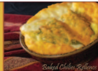
Baked Chicken Roll-ups

Locally owned and independently operated since 2004.